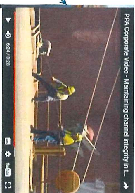
Advertiser Video Link