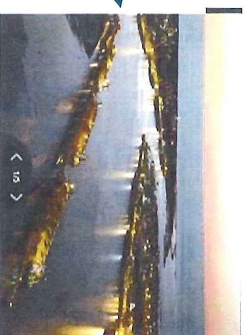
Advertiser Image Gallery